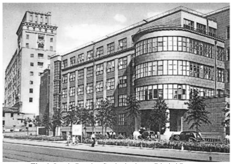
Fig. 1. Iconic Russian Soviet heritage. Dimitri Razov. The Academy of planning. Moscow, 1937 [6, p. 499]

Also The Golosov Zuev workers club in Moscow (by Ilya Golsov, 1926—1928) is a remarkable structure which not only reveals the Russian Constructivism style but also represents the new building type of the Soviet era "Workers Club". This new function provided a social outlet for workers to encourage their political and physical activities [1, p 82—83].