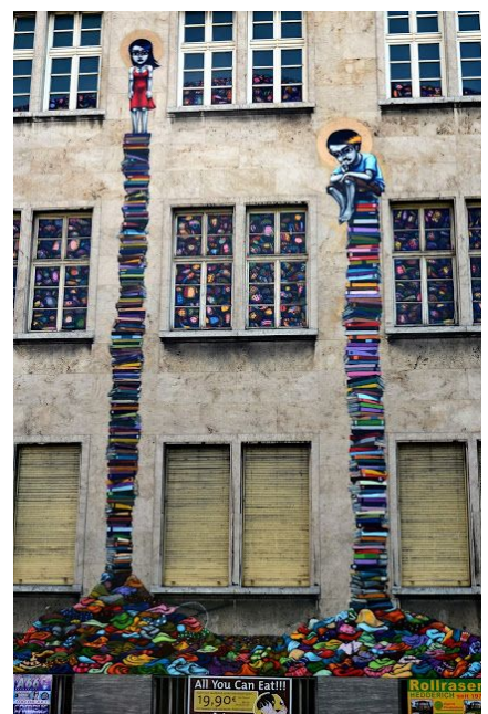
Fig. 5. Street art giving life to plain facades. New Mural In Frankfurt, Germany, By Brazilian street artist Walter Nomura aka Tinho: Frankfurt, Germany.

blocks, other point of view might regard it as full of chances. To Imaging how much creativity work can be produced on these facades, a person can take an enormous plain paper and freely let go his imagination. A regional street art campaign for renovating Façades can be led to retrieve beauty, uniqueness and identity these districts lacking, and create original attractive urban environment. The Russian society is rich of diverse nationalities, each of them has wealthy historical and cultural artistic and architectural heritage. Traditional art of every region can be painted on facades giving them the identity of the regional context of their city and society. Sculptures can be used to bring back life to public spaces and children's play grounds. Some districts may decide to lead contemporary art program gaining special identity (Fig. 3—5).